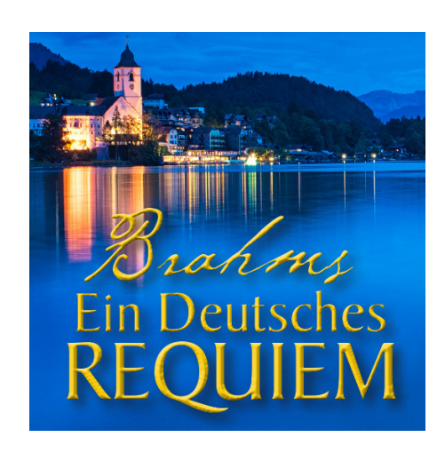
in printed concert program November 18, 2018