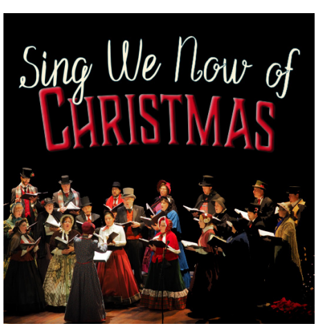
Plus an opportunity during the Christmas season to have your ad projected on screen to the audience before the concert